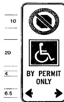
DISABLED STOPPING EXEMPTION Sign

Rb-95 30 cm x 75 cm Font Helvetica Bold Condensed Colour Interdictory Symbol – Red Reflective Symbol of Access and Symbol Border – Blue Reflective Legend & Border – Black Background – White Reflective