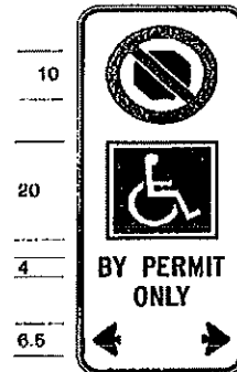
DISABLED STOPPING EXEMPTION Sign

Rb-95 30 cm x 75 cm Font Helvetica Bold Condensed Colour Interdictory Symbol -- Red Reflective Symbol of Access and Symbol Border -- Blue Reflective Legend & Border -- Black Background -- White Reflective