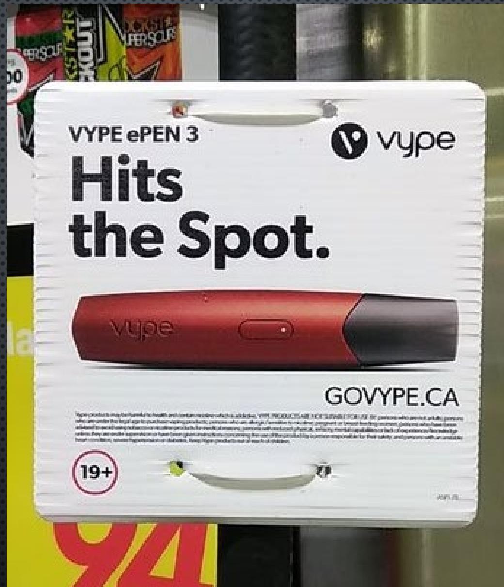
Petro Canada – on gas pump (Huron Church, Windsor)