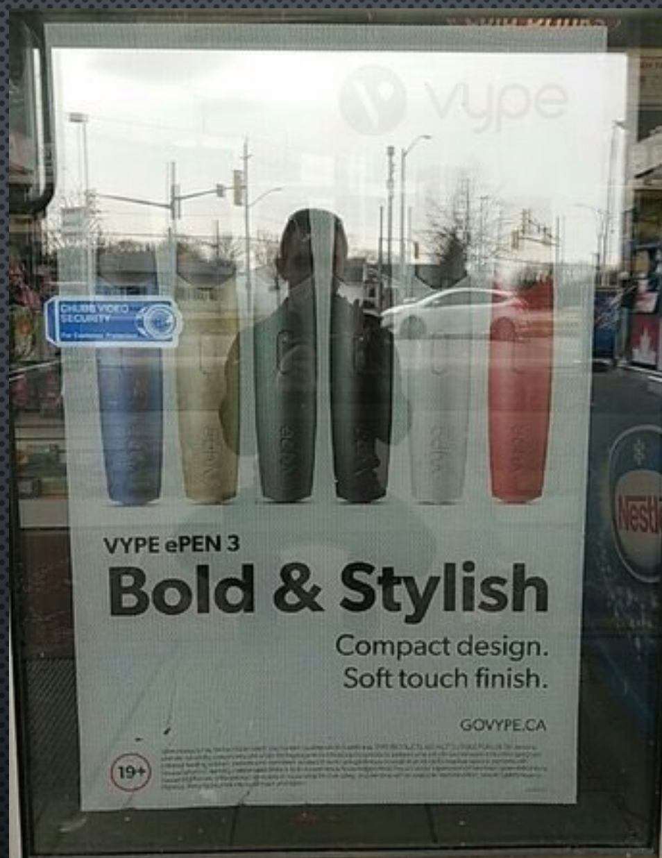
Petro Canada – displayed through door (Front Rd., LaSalle)