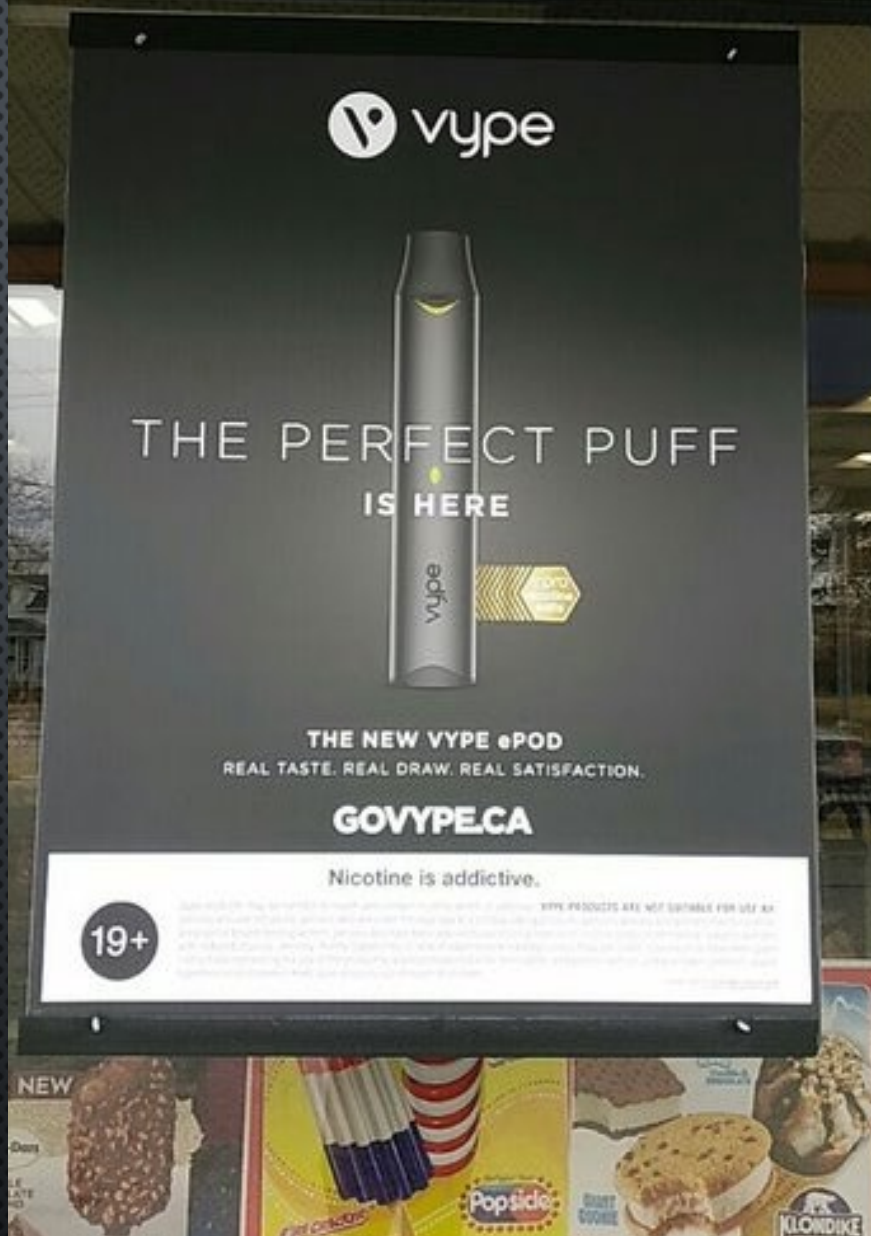
Mac's – displayed through window (Front Rd., LaSalle)