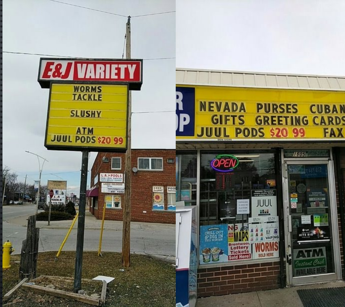
E&J Variety – store's signs (Front Rd., LaSalle)