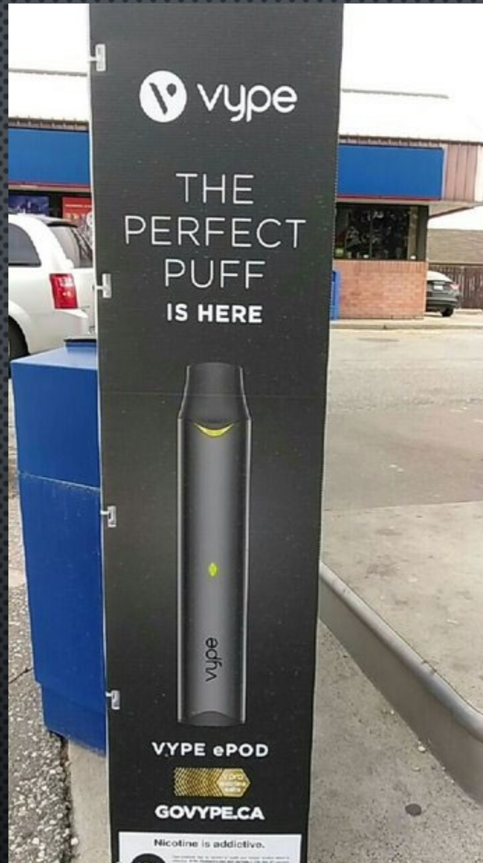
Mac's – next to gas pump (Front Rd., LaSalle)