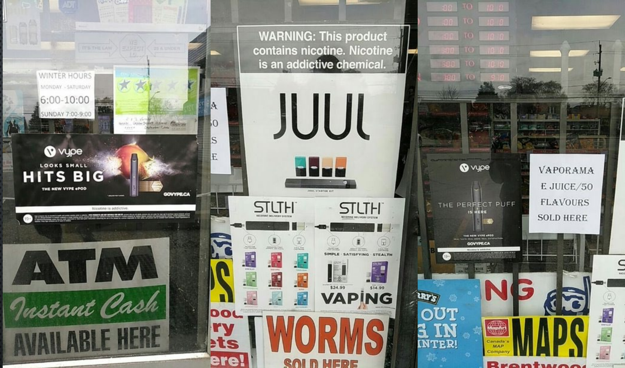
E&J Variety – displayed through door/windows (Front Rd., LaSalle)