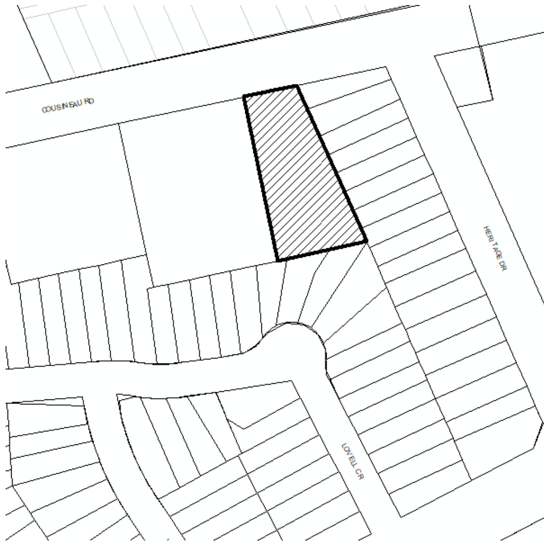
Figure 1: Key Map of the Subject Property